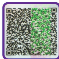
LORS on the QR code