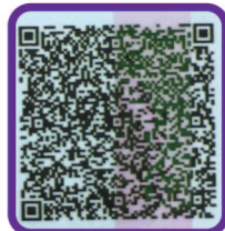
Transparent Pink color LORS