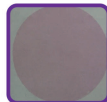
Semi-transparent Pink color LORS Label